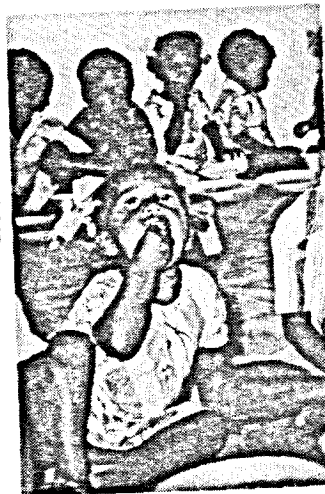
GOUVERNEMENT DE TAMIL NADU