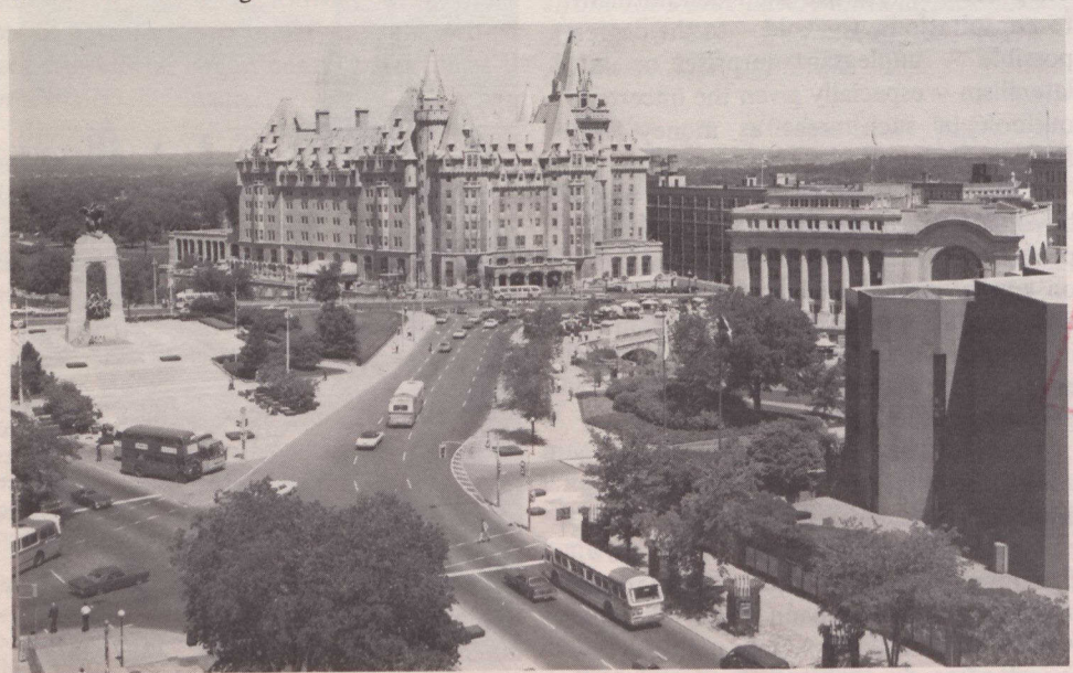
A view of the Chateau Laurier. To the left is Confederation Square and at the right the Conference Centre and the National Arts Centre in Ottawa.

Also arising out of Venice, leaders will have before them the report on North-South issues to which I have alluded al-