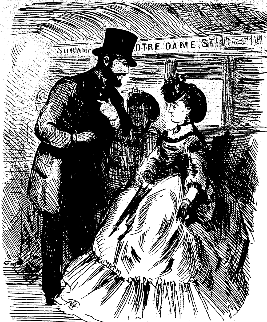
URBANE GENTLEMAN.—"Excuse me, Madam, what did you say?" LADY, (who has just taken the seat the gentleman had vacated for her.)—"Nothing, sir." GENTLEMAN.—"Oh! I beg your pardon; I thought you said THANK YOU!"

FOR SALE OR TO LET. THAT LARGE FOUR STORY CUT-STONE building in St. Therèse Street, Montreal, now occupied by the Military Control Department as Stores. Very suitable for a Wholesale Boot and Shoe factory, or other similar purposes; also for Stores. Possession 1st of May. Apply to