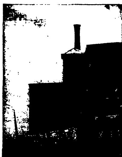
The same THE... Chimney AFTER American stoker was installed.