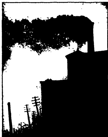
Photograph of a Chimney BEFORE the American Stoker was installed.