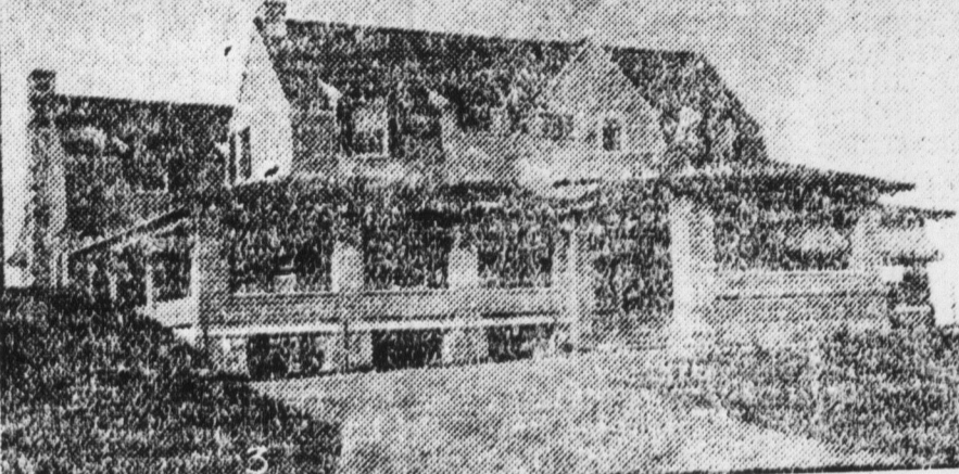
(1) On the Golf Links at St. Andrew's, New Brunswick. (2) Picture of a statue of St. Andrew erected on one of the local church walls. On the head is a robin's nest. (3) Residence of Lord Shaughnessy at St. Andrew's.

NEARLY everybody knows that golf was first played by the Scotch. A veteran devotee of the game, once said that Scotland's greatest contribution towards the welfare of mankind was the royal and ancient game.