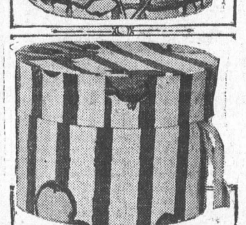
FANCY GIFT BOXES.

lined. The boxes hold gifts and may be used for the accessories of the toilet, such as neckwear, corsage bouquets, necklaces, etc. Some of them are large enough to be used as hat boxes.