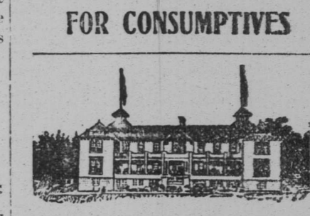
MUSKOKA FREE HOSPITAL FOR CONSUMPTIVES. MAIN BUILDING FOR PATIENTS.

THEN SEND YOUR CONTRIBUTIONS TO THE MUSKOKA FREE HOSPITAL FOR CONSUMPTIVES