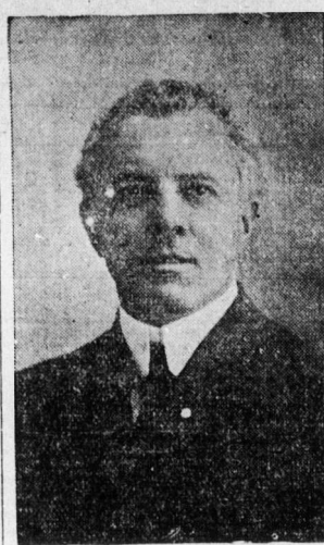
ALD. CHARLES GARDNER, Re-elected at head of poll in Ward No. 5.