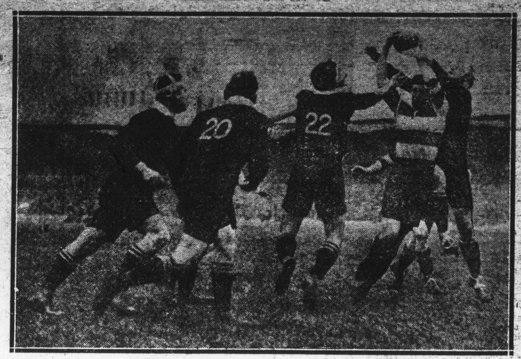
SMOTHERING THE ENEMY-"ALL BLACK'S" STYLE

The "All-Blacks," famous New Zealand Rigby team, is to tour Canada, sailing from Liverpool on January 24th aboard the "Montlaurier" and travelling via Canadan Pacific lines. At Vancouver and Victoria they will play Canadian teams. They did not lose game on their recent tour of the Old Country and France. The photograph taken in the match against Cardiff gives an excellent impression of the deadly "All-Blacks" team-work.