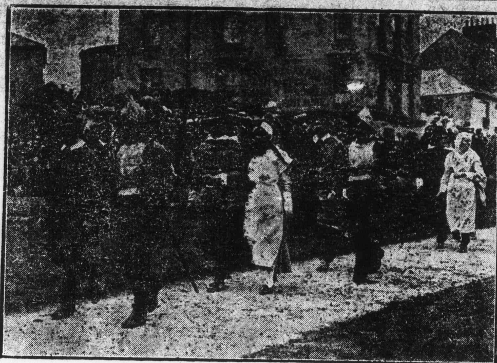
"MAYFLOWER" TERCENTENARY AT PLYMOUTH.

"Have you been touching the barometer, Jane?" "Yes, it's my night out, so I set it to 'fine.'"—London Mail.