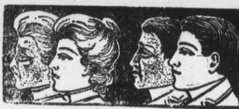
BEFORE AND AFTER TREATMENT.