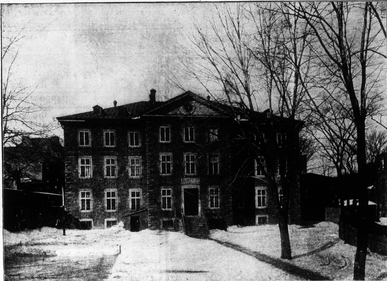
ST. PATRICK'S ORPHAN ASYLUM.

Corner of Notre Dame and St. John Streets