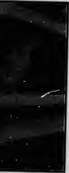
SHOWING ROOSTS, RAW FILLING.

y particular method ue healthy vigorous t in the houses con- on front.