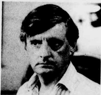
Katie's troubled father in Twenty-one is played by Jack Shepherd.