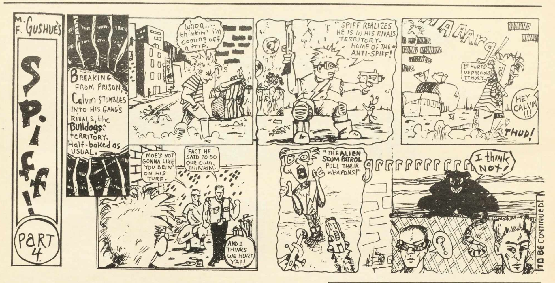
Welcome to Spiff Part 4: A reality where even demi-demons fear to stomp. Last week's Spiff featured our hero turning his roomate into reticular Rocco. This week: Spiff meets a gang of stupid thinking tough guys.