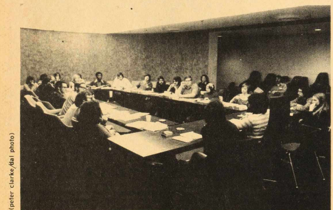
Dalhousie new Student Council in action.