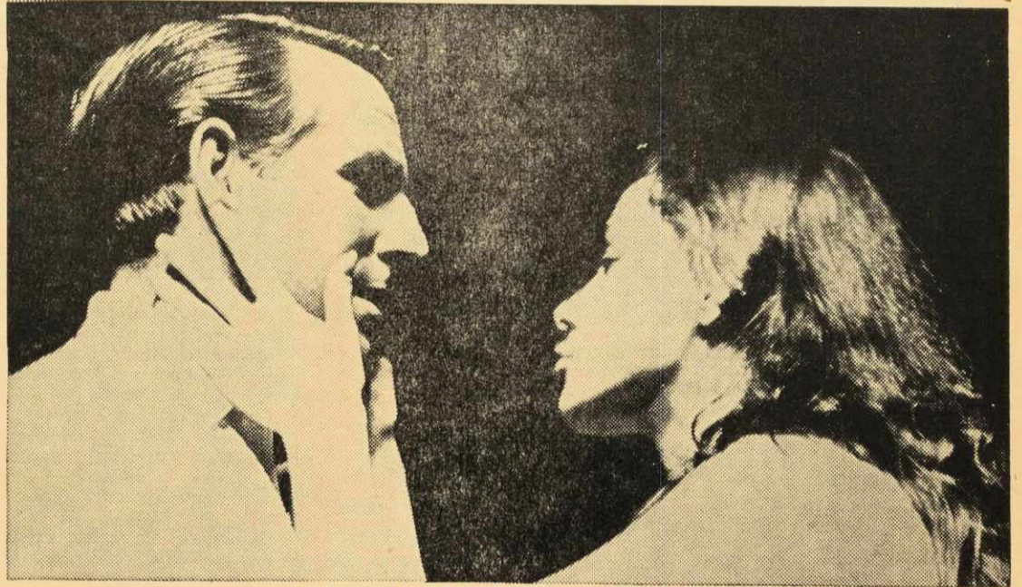
Haemon and Antigone

Shaw's insight into society and its dilemmas is indeed valuable, and cleverly presented in this very funny comedy.