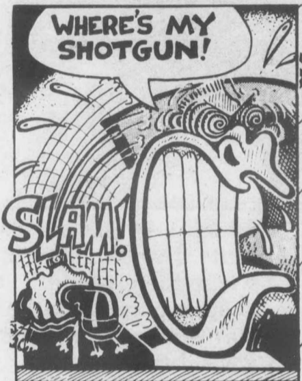
Peter Bagge's Studs Kirby deals with his current problem in a familiar manner.

Its a crazy, crazy world that Bagge's rubber creations inhabit but sometimes its so breathtakingly real that one has to pause for breath. Meet Girly Girl the enfant terrible that makes Attila the Hun look like runny margarine. Studs Kirby all American bastard redneck that is frighteningly reminiscent of the bigot in all of us. The Bradley Family, next door neighbors from hell and of course Chet and Bunny Leeway the loving ordinary couple that can be bitching about personal habits one moment and dissolving into a Picasso (literally) in the next. Totally cool, totally neat and boy is it ever funny.