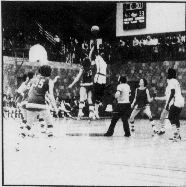
The Red Bloomers beat the top rated Concordia Stingers last weekend 76-75.

The UNB Holiday Classic was an extremely successful tournament for the Red Bloomers who are looking forward to more action when Acadia visits UNB Saturday January 15th at 6:00 p.m.