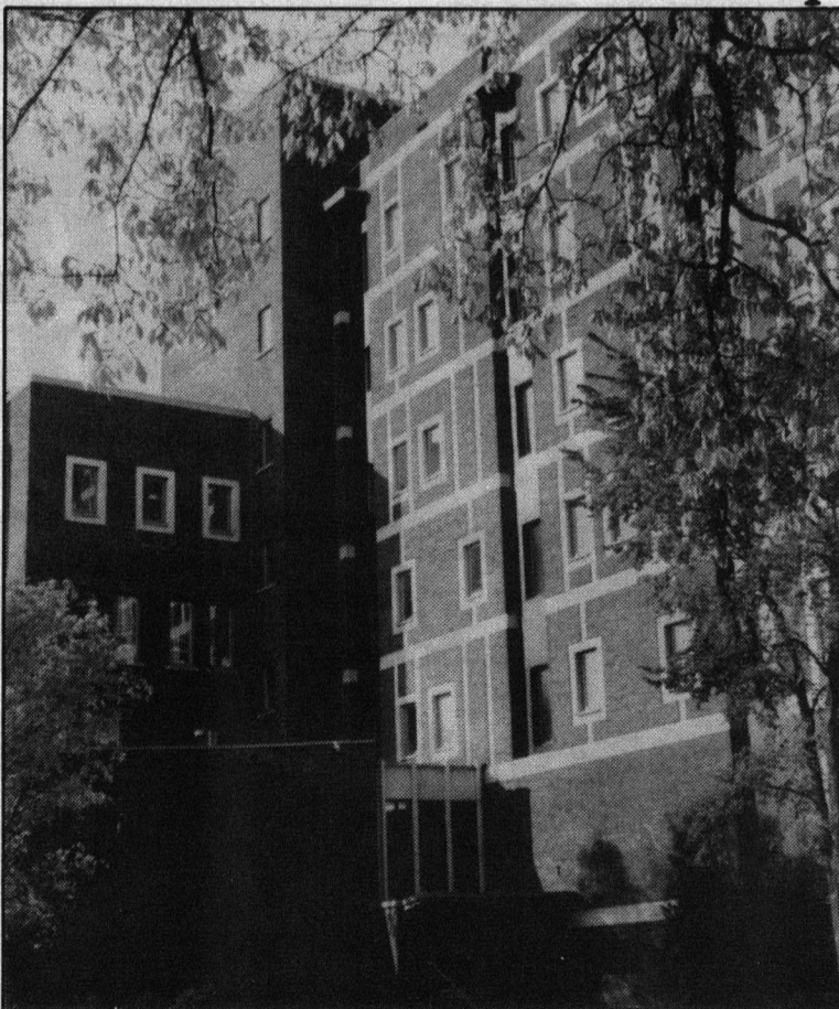
The Bio Sci building — the U of A's own twilight zone.