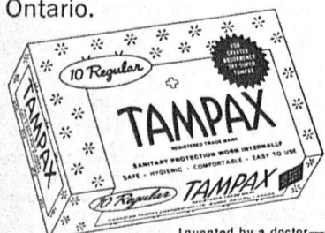
Invented by a doctor— now used by millions of women

Many girls start using Tampax internal sanitary protection in the summer so they can swim any time of the month. Yet Tampax has just as many advantages in the winter! There's no chafing, no irritation, no odor, no bulk, no belts, pins, pads, no worries, no embarrassment. Tampax is made of pure surgical cotton, lock stitched for safety, protected by a silken-smooth container-applicator. Your choice of 3 absorbencies (Regular, Super, Junior) wherever such products are sold. Canadian Tampax Corporation Limited, Barrie, Ontario.