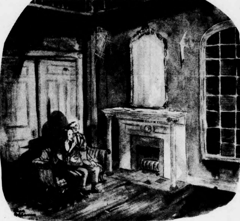
"Are you unhappy, darling?" "Oh, yes, yes! Completely."

This minor sour note aside, The Addams Family is a very entertaining film. It may not move as quickly as other films in its genre, but it has more