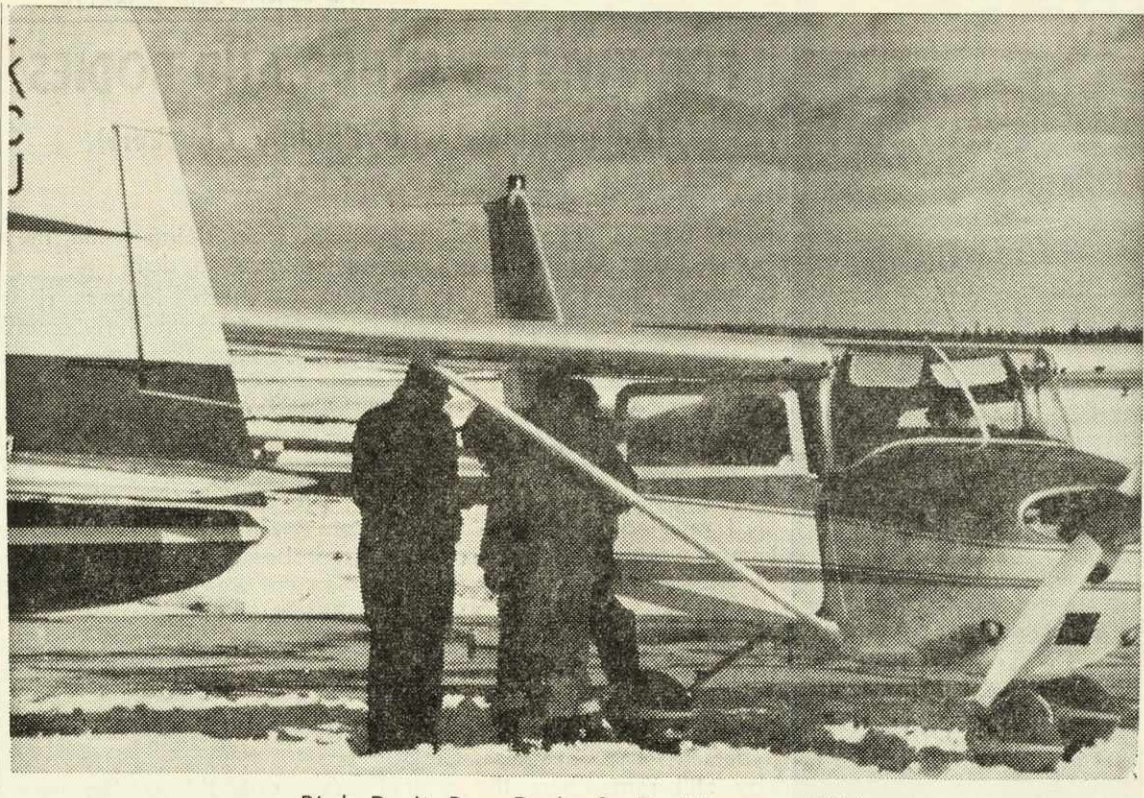
Birds Do It, Bees Do It, So Do We --- FLY!

Finally...smoking satisfaction from a filter cigarette