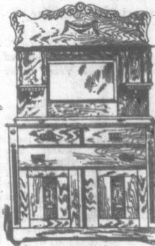
No. 5616—Sideboard Elm, antique finish, top 18x46 in. One long drawer, two small drawers (one lined for silver) $10.75.