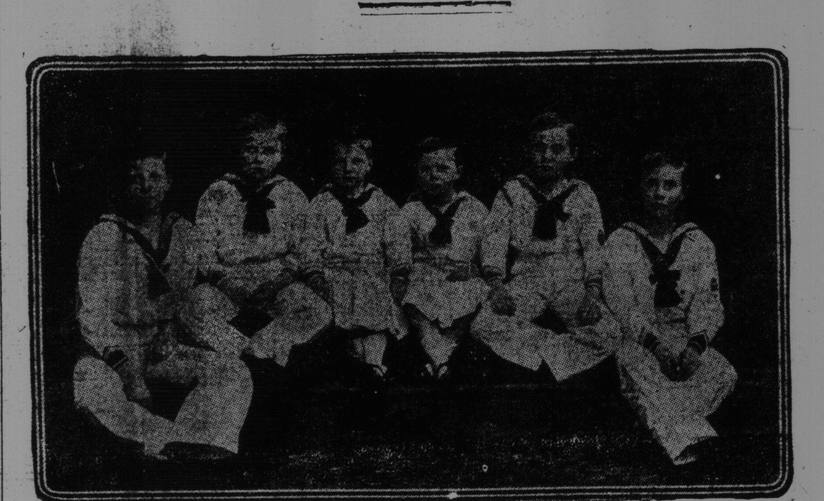
BERLIN, Sept. 16.—Although not by nature and character a friend of children, the Kaiser is accused of spoiling his nephews shown in this photo. The six little children among whom are two sets of twins, are the sons of the Kaiser's favorite sister, Princess Frederick Charles of Hesse Cassel.