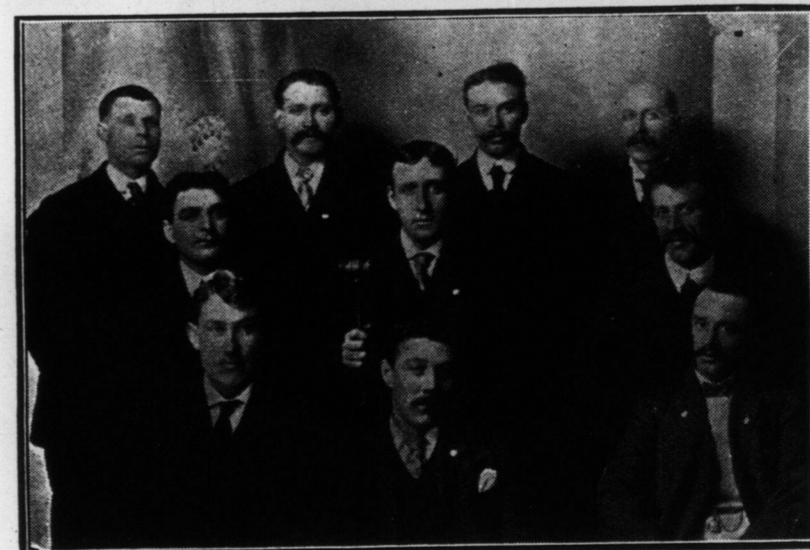
COAL DRIVERS LOCAL NO. 457 OF TEAMSTERS.

Ten genuine hand-made little Havana Cigars in a Box for 25c. Just the thing for a short smoke. TRY THEM A. Clubb & Sons, Sole Distributors, 5 King West