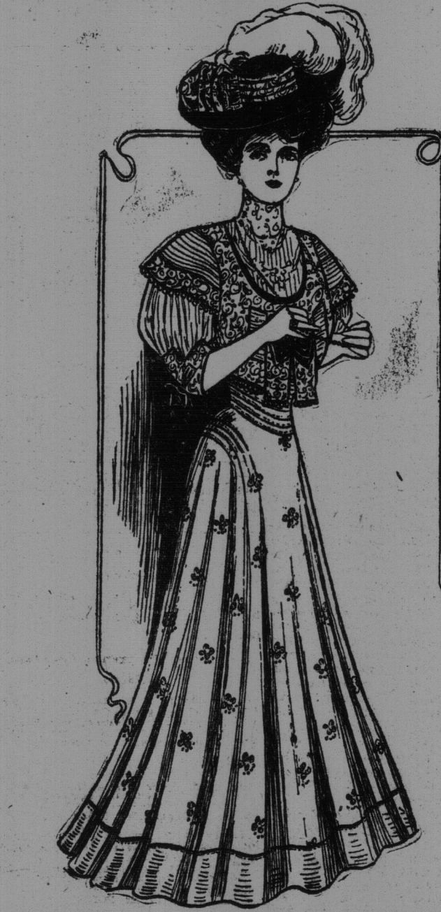
DINNER OR THEATRE GOWN OF SILK AND LACE.

The illustration shows a gown which would be suitable for any evening affair at which a low-neck gown is not required. The skirt, which was of pale blue tulle, was figured with a flower pattern, was finished around the bottom with a deep hem of pale blue velvet piped with a delicate pink, which repeats the color of the flower pattern. The upper part of the skirt was cut with circular ruffles, the tops of which were tucked to curve about the hips, a fitted tucked girdle being attached in princess effect. The bodice was finished with wide bands of heavy lace arranged in bolero effect, the underclothes being of pale blue chiffon. The top of the sleeves was of tulle, the edge of the sleeves and the jacket being finished with silk ball fringe. Pale blue velvet bows were used on the front of the bodice and on the sleeves. Selected animal tuckers.