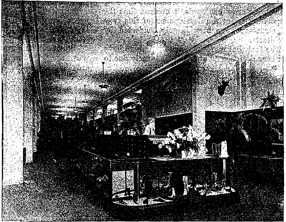
HOSIERY AND GLOVE DEPARTMENT, GROUND FLOOR: FAIRWEATHERS, LIMITED, TORONTO.

The field of commercial and industrial building, says the Architectural Forum , is one of particular interest to architects at this period of reconstruction for several reasons: the resumption of building in