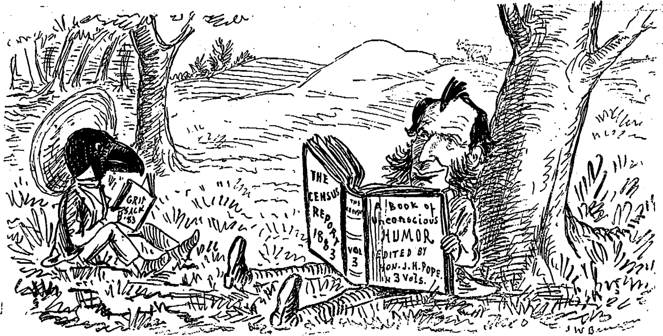
THE FUNNIEST BOOKS OF THE SEASON.