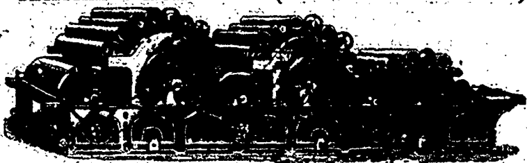
English Sales Attended.