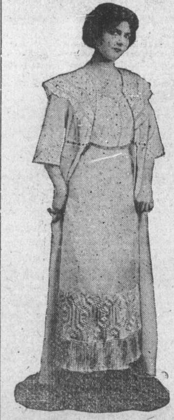
TEA GOWN OF THE SIMPLE VARIETY.

A man entered a shop one bitter cold day and bought a woollen muffler. When he opened the muffler he found inside it the photograph of a beautiful girl, together with a note saying: "If you are single please write to me." A name and address followed and the man smiled. He was single, and he put the photograph on his sitting room mantel. There every evening looking up from his book, he beheld it. It was very beautiful, and in a week he had fallen head over heels in love. So he wrote the girl. Another week passed, a week of anxious, nerve-racking suspense. Then the love-sick man received this crushing letter: "Sir—The Mary Smith to whom you wrote was my grandmother. She died nine years ago, aged 86. Yours truly. Our heart-broken bachelor, on looking into this strange matter found that he had foolishly bought the muffler from a dealer who didn't advertise.—Pittsburg Dispatch."