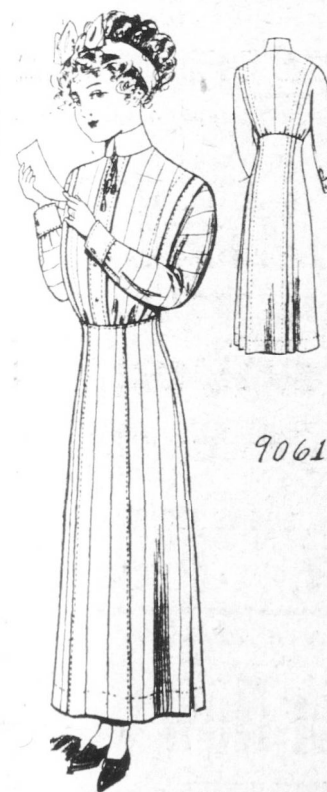
Shirt Waist Suit for Misses and Small Women.

Blue serge with a fine hairline stripe of white was used for this model, which consists of a plain shirt waist and a gored skirt, that may be finished with a high or regulation waistline. The body of the waist is cut in one with the sleeve. The pattern is cut in 5 sizes: 14, 15, 16, 17 and 18 years. It requires 6 1/2 yards of 27 inch material for the 15 year size.