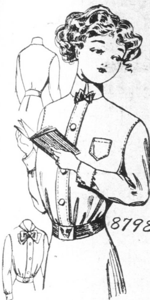
Ladies' Shirt Waist.

The prominent features of this design is the long shoulder and the "manish" finish of the sleeve which is set into the armhole without any furling. The waist is plain over its upper part. It may be finished with a low or high collar. The pattern is cut in 5 sizes: 32, 34, 36, 38, 40 and 42 inches bust measure. It requires 2 1/2 yards of 27 inch material for the 36 inch size.