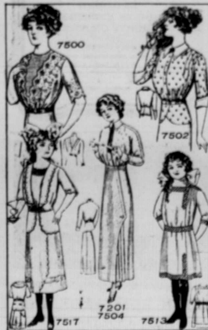
LADIES' MISSES' AND CHILDREN'S ATTIRE

The above patterns will be mailed to any address by the Fashion Department of this paper, on receipt of ten cents for each.