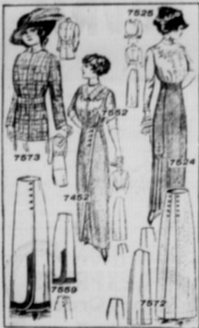
A SMART SUIT AND OTHER GOOD MODELS

7573—Mackinaw or Belted Coat for Misses and Small Women, 16 and 18 years. With or without Hood or Pockets, with Sleeves Drawn in at the Wrists or Plain.