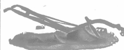
No. 21 Tinkler Wheel Plow