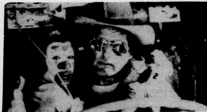
Above, cover of cineAction! shows Linda Manz in Out of the Blue . Left, Manz and director/actor Dennis Hopper.