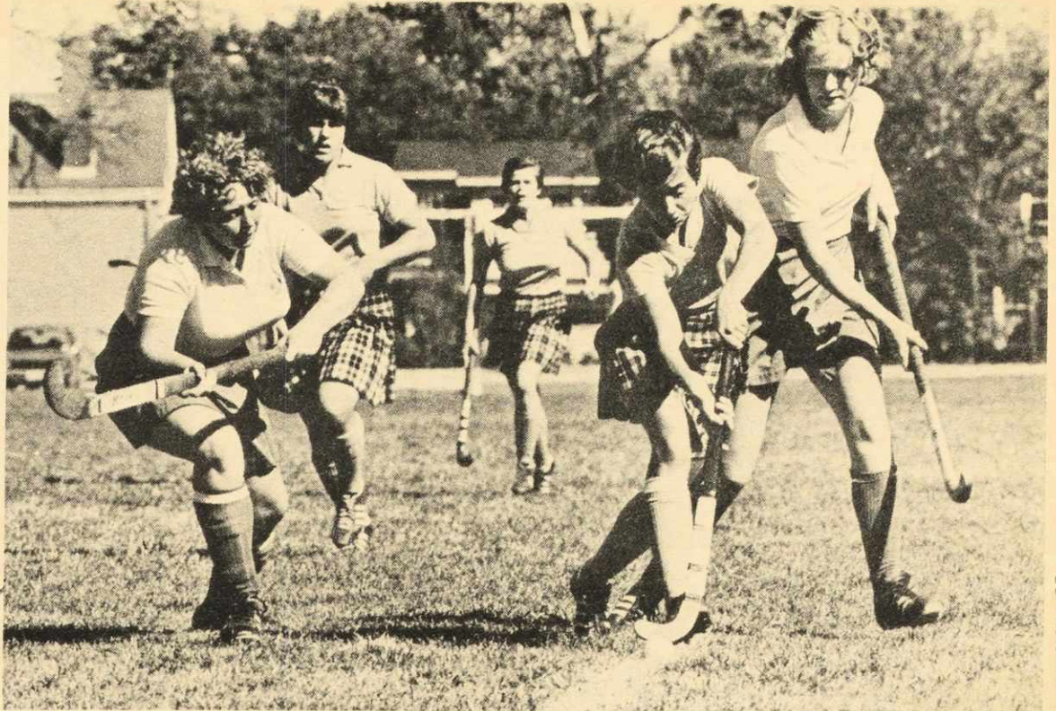
The Dalhousie Women's Field Hockey team won two games last weekend. The Dal team won the National championship two years ago.