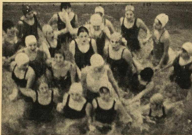
COME ON IN, THE WATER'S . . . Dal's Aquabelles make a big splash at synchronized swimming practice session.