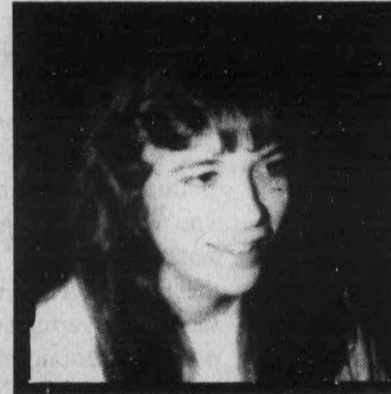
Sub Penguin "Other vegetarians"