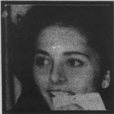
AIESEC person "Textbooks"

What do vegetarians eat for Christmas dinner? by: Red