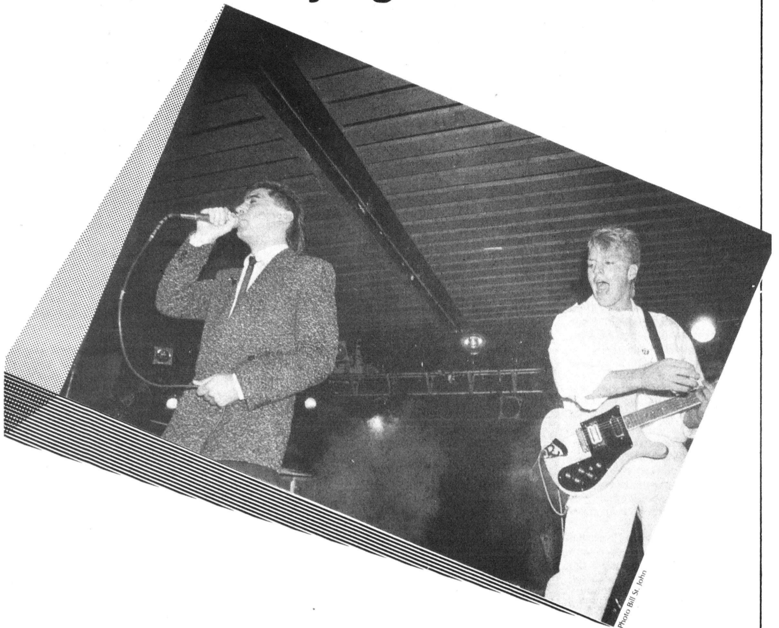
Seventeen Seconds in action last Friday at Dinwoodie Lounge: "Our dreams have never been as real as they are now."