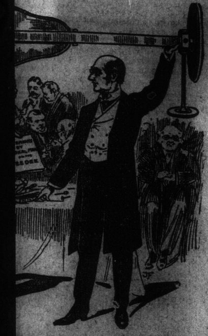
poval of the British Medical corded the Veedee.

atica, Lumbago, Neuritis, Neuronchitis, Catarrh, Indigestion. RGE in their own homes the obtained from the VEEDEE ULATOR