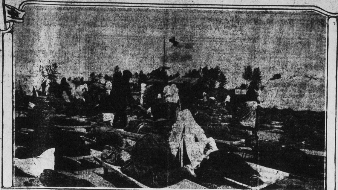
RUSSIAN RED CROSS NURSES ATTENDING "GASSED" AND WOUNDED RUSSIANS WHO HAD BEEN BROUGHT IN DIRECT FROM THE TRENCHES ON STRETCHERS