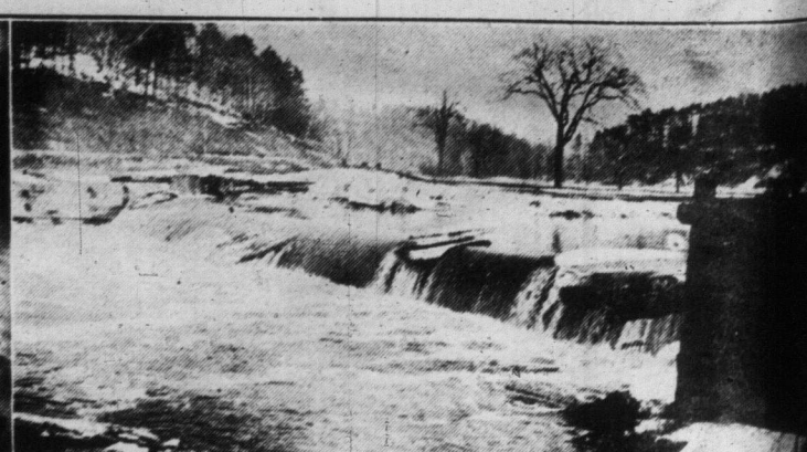
Last tardy ice-cakes plunging over dam.