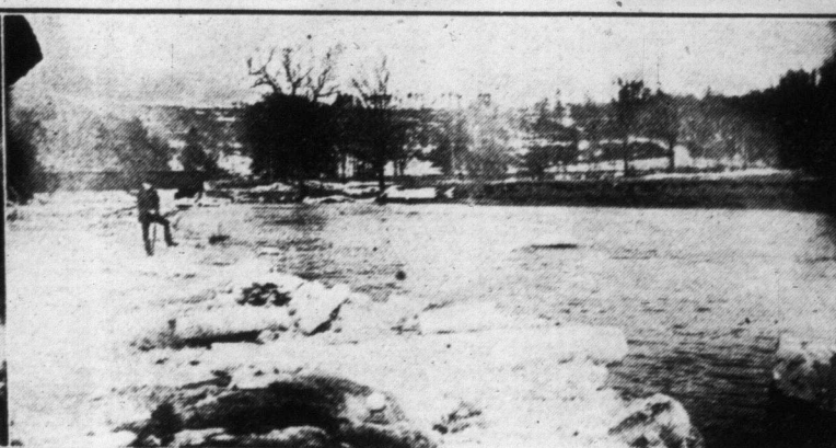
Shallows where the pike and suckers lurk.