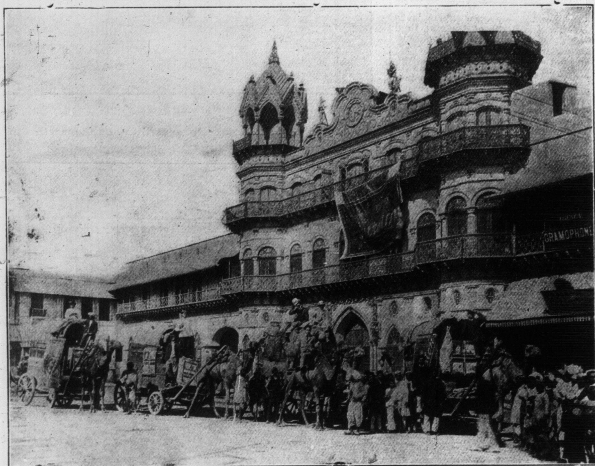
HOWARD THURSTON'S PARADE LEAVING THE NATIVE THEATRE IN CALCUTTA, INDIA, FOR A TOUR THRU THE HINDU QUARTERS.