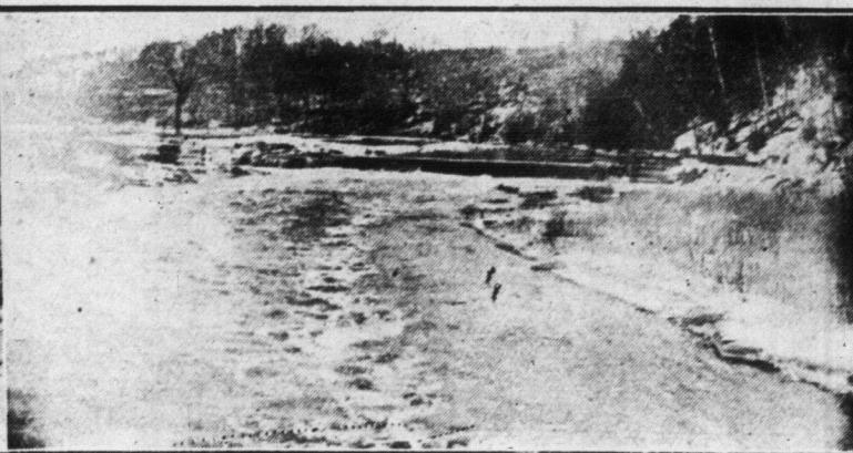
Swift strip of water below the dam.