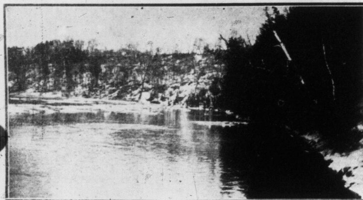
Quiet spot in an elbow of the Don.