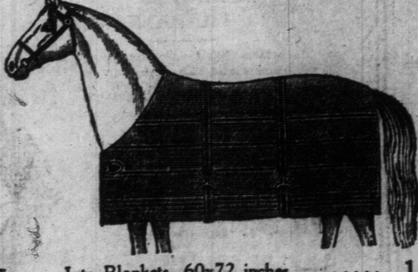
Jute Blankets, 60x72 inches . . . . . 1.00 Heavy Jute, 66x72 . . . . . 1.50