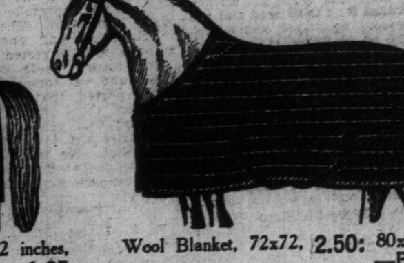
Wool Blanket, 72x72, 2.50; 80x80 4.35