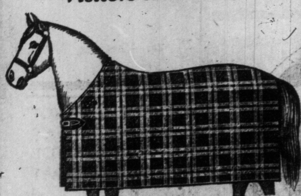
Extra Heavy Fawn Duck, size 78x78. 2.50

Visitors to the City will find special value in the horse blankets illustrated. The materials are well selected and the fastenings standard in every way.