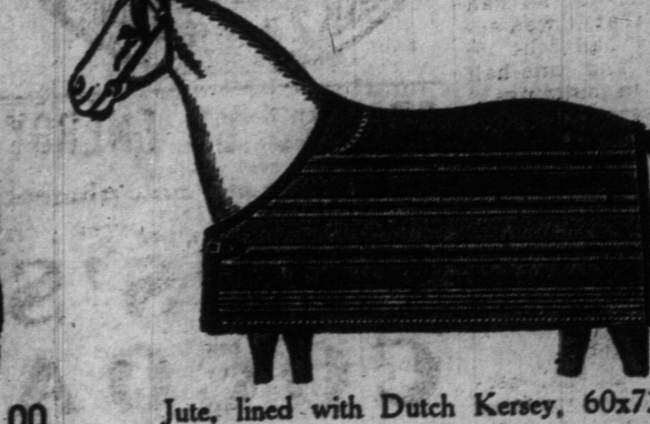
Jute, lined with Dutch Kersey, 60x72 inches, extra value . . . . . 1.25