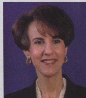
Charlene Barshefsky United States Trade Representative