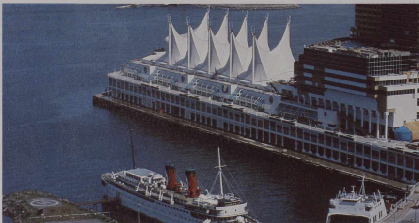
Canada Place — several buildings in one.

Canada Place is really several buildings all on one site. After Expo, it will consist of a hotel, cruise-ship terminal, World Trade Centre office building, giant-screen movie theatre and eventually an international trade and convention centre.