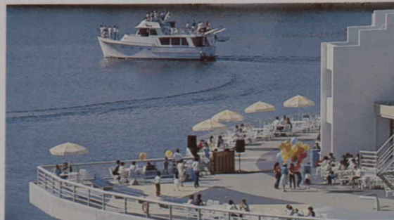
Many of the pavilions extend over the water of False Creek.

The main site is connected end-to-end by a 5.5 kilometre monorail system, elevated five metres above the ground and offering its passengers a