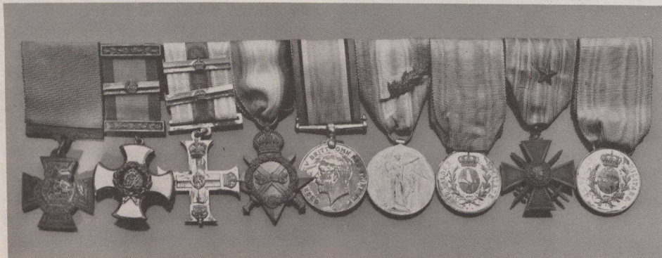
Medals belonging to William George Barker include: (left to right) Victoria Cross, Distinguished Service Order and bar, Military Cross and 2 bars, 1914-15 Medal, British War Medal, Victory Medal and Oak Leaf, Italian Medal first class, French Croix de Guerre and Star and Italian Medal second class.

During the war, he is credited with destroying a total of 50 enemy machines. For his service he received the Distinguished Service Order (twice), the Military Cross (three times), Italy's Silver Medal for Military Gallantry and the French Croix de Guerre. Commander Barker served with the post-war Royal Canadian Air Force until 1926. He died in 1930.