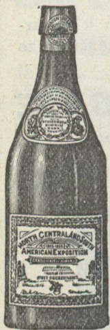
FAC-SIMILE OF WHITE LABEL ALE