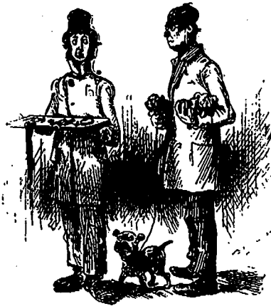
TEN YEARS LATER.