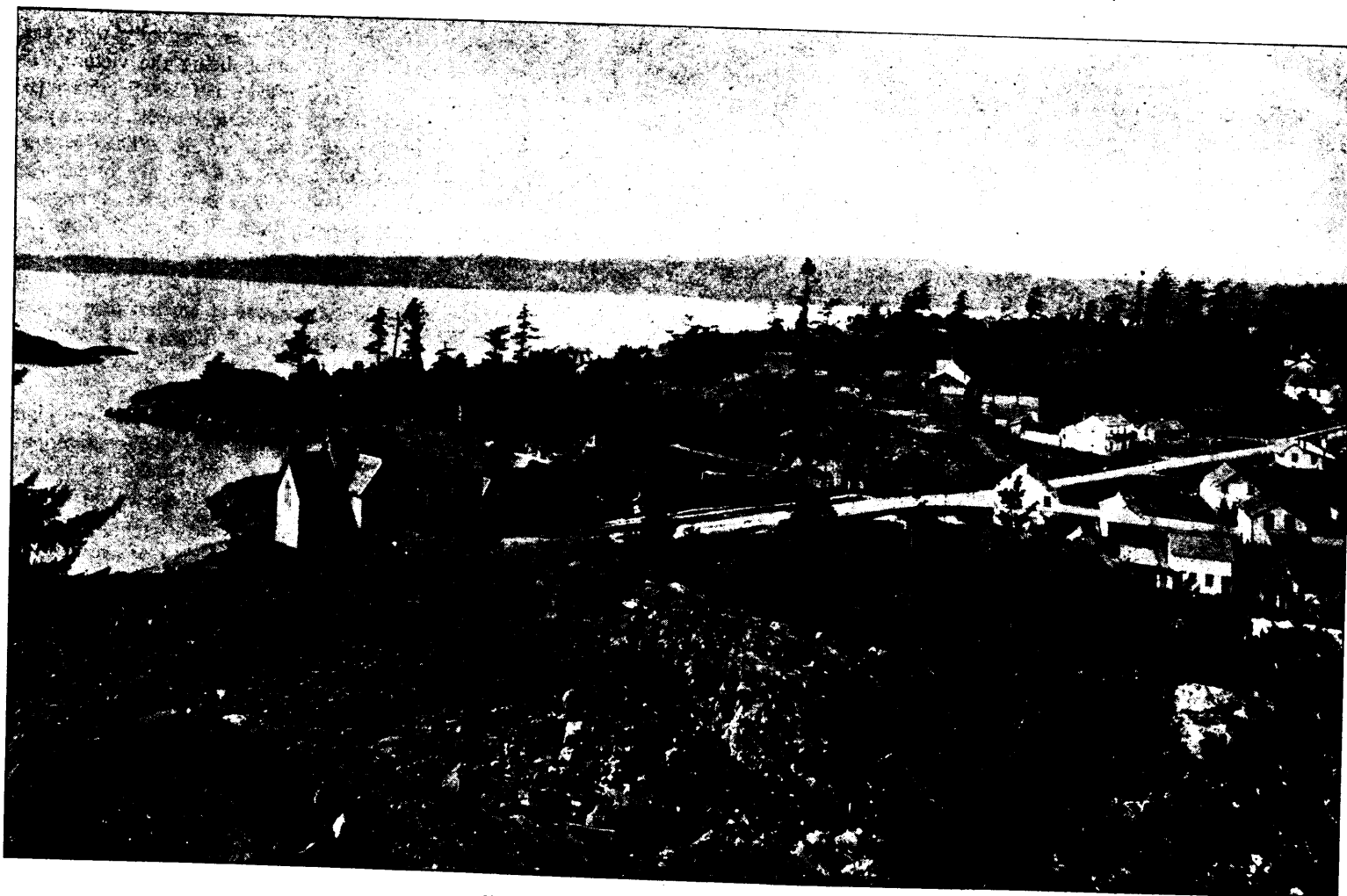
ESQUIMALT HARBOUR, SOUTH END.