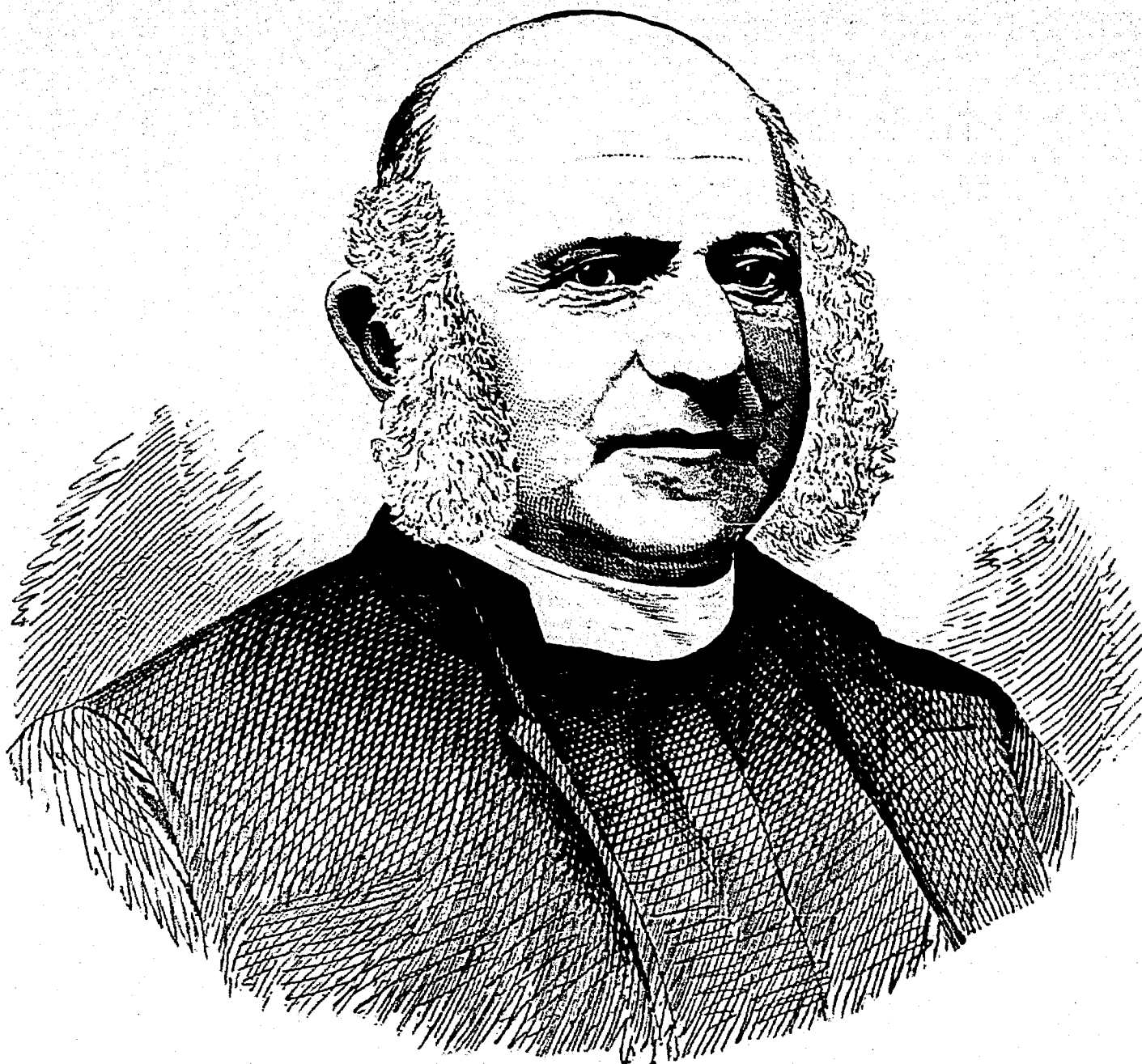
THE VERY REV. J. HELLMUTH, D.D.

class-rooms, dining-hall, library, drawing-rooms, parlors, and bedrooms; a sanatorium, bath-rooms, supplied with hot and cold water on each floor, together with all other suitable conveniences. The internal fittings are very complete. They have been procured from local makers, no less than sixteen pianos being included, the whole costing, with the necessary school apparatus, in the neighbourhood of $20,000.